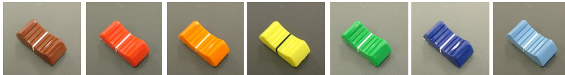
CP-x-BR (Brown) CP-x-R (Red) CP-x-OR (Orange) CP-x-Y (Yellow) CP-x-GR (Green) CP-x-BL (Blue) CP-x-LB (Light blue)