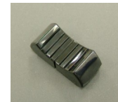
Black knob without center line. (CP-2N-BK)