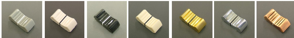
CP-x-GY (Gray) CP-x-W (White) CP-x-BK (Black) CP-x-IV (Ivory-white) CP-x-G (Gold) CP-x-SV (Silver) CP-x-BZ (Bronze)